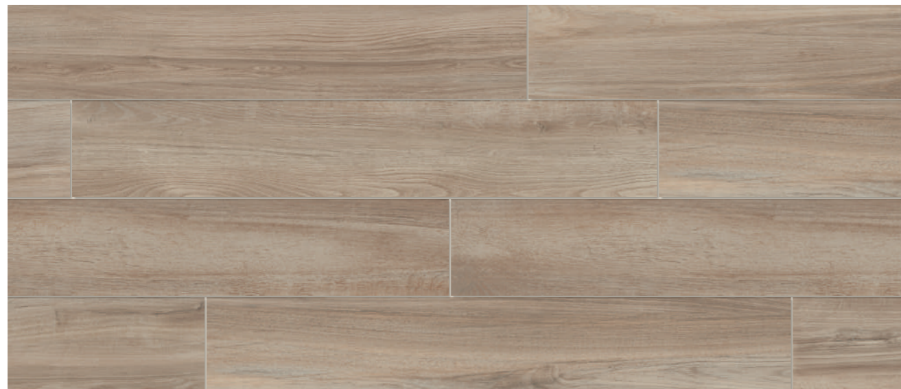
EVO LAND NOCE 20x119,5 - 8"x48" - Sviluppo Grafico - Graphics Development pcs.12