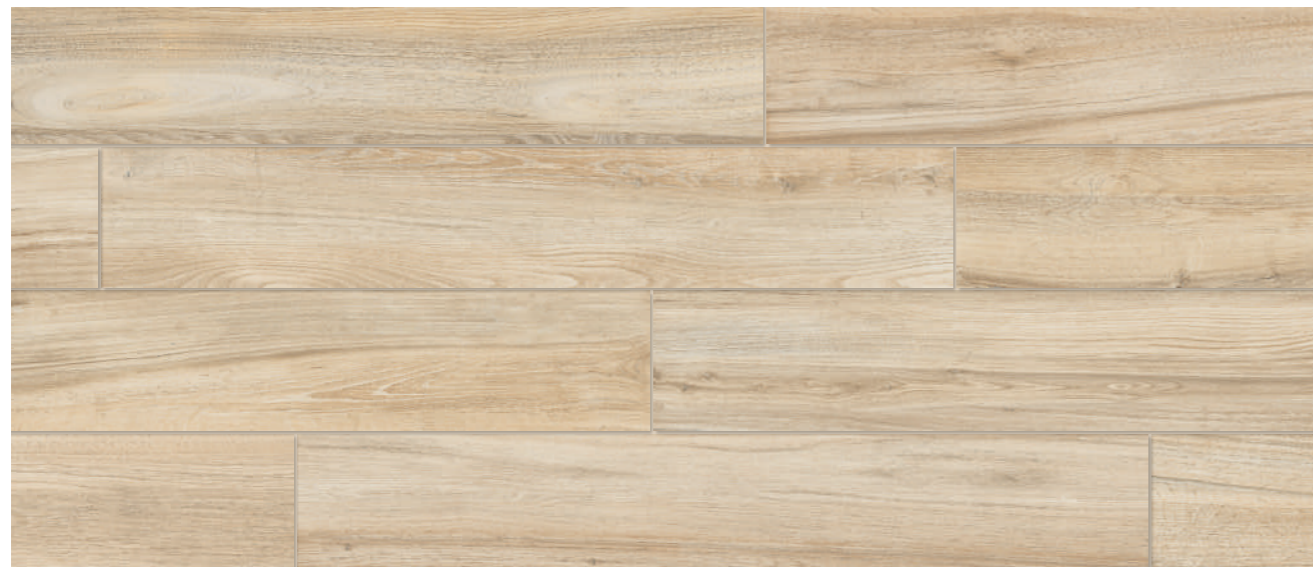
EVO LAND BEIGE 20x119,5 - 8"x48" - Sviluppo Grafico - Graphics Development pcs.12