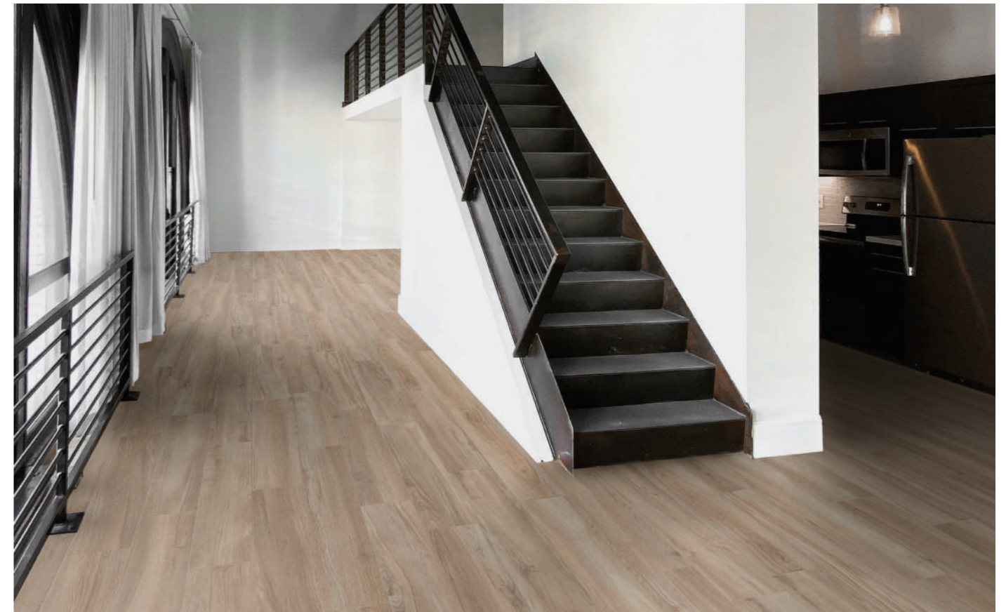
floor EVO LAND NOCE 20x119,5 - 8"x48"