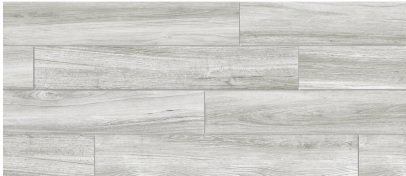
EVO LAND GRIGIO 20x119,5 - 8"x48" - Sviluppo Grafico - Graphics Development pcs.12